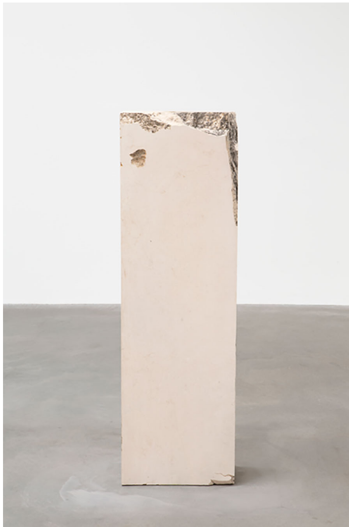
Trisha Donnelly, Untitled , 2019, Botticino marble, 133 x 40 x 19 cm.

Notice the big signal lamps that look like something from a train next to the east gallery's desk; the printout of another twitchy grisaille shape taped under the stairs in the west gallery; the tarps over the skylights. Donnelly plays the clearly staged against the seemingly unintentional until aesthetic pleasure arises precisely from the ambivalence of this contrast. She has removed one door and opened another in the corners of the east gallery, revealing a dark hallway of old brick and blocked-up, alley-facing windows. An open hatch to the roof