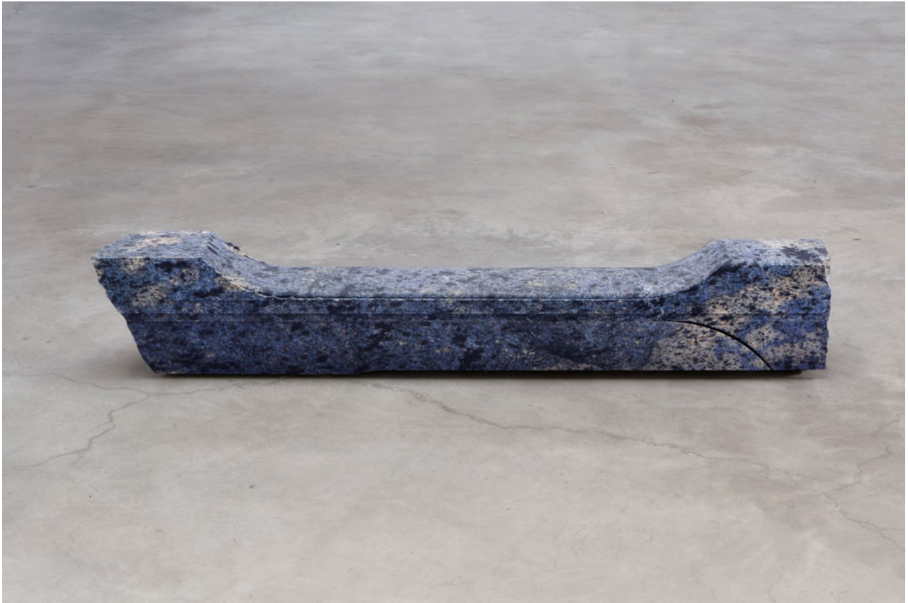
Trisha Donnelly, Untitled , 2019, Azul Bahia granite in three parts, 31 x 166 x 18 cm.

lets in winter cold; on stormy days, rain streaks its cinderblocks and pools on the concrete floor. This is why a galvanized metal outlet, exposed to and softly lit by the elements, is protected by a rough, translucent flap of plastic. Donnelly's deconstruction of the white cube apparently required this precaution. Of all the show's moments, this admission of fragility is the most beautiful.