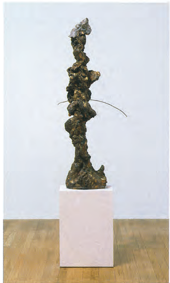
REBECCA WARREN, BOBO , 2006, bronze, acrylic paint, branch, 51 1/8 x 14 1/8 x 13"/ Bronze, Acrylfarbe, Ast, 130 x 36 x 33 cm.

from the past, it is that moment: the electric frisson of the modern in its nascence, transliterated here through the most irreducible aspects of the contemporary—a potent cocktail of ugly female strength, formal grotesquery, radical ambivalence of attitude, and generalized inconclusiveness—and leading to fundamental uncertainty punctuated by awkward laughter. To echo that moment and ensure that it reverberates for as long as possible remains an exhilarating problem—for her, and for us.