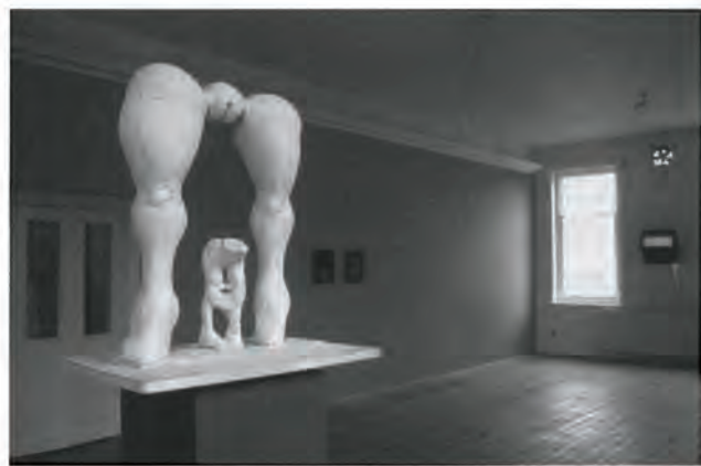
REBECCA WARREN, HELMUT CRUMB , 1998, installation view, "It's a Curse, It's a Burden" at The Approach, London, 1999.

possess an uncanny psycho-physiological rectitude and a purposeful energy. Their surfaces are rough and at times seem barely modeled from the raw blocks of clay out of which they emerge. "SHE" unashamedly evokes and engages with a powerful history of expressive figurative sculpture stretching from Degas and Rodin through Boccioni to Fontana, taking in Picasso and the German expressionists for good measure. Warren seems to want to grapple with this lineage of male masters on their own terms, rather than women sculptors of the female form such as Elizabeth Frink. Warren's references to popular culture and to psychology show that she is culturally conscious, but neither irony nor critique is a significant motive behind these works. They can be elucidated by comparisons but they cannot be read as essays. They are not hewn from lard or chocolate nor will they disintegrate through sustained exposure to the climate of East London. Their most up-to-date feature is their placement on studio trolleys. This gives the sculptures an added measure of dynamism (they could scoot off anywhere) and informality (they are not rooted) but was initially a practical step on the part of the artist (they cannot otherwise be moved).