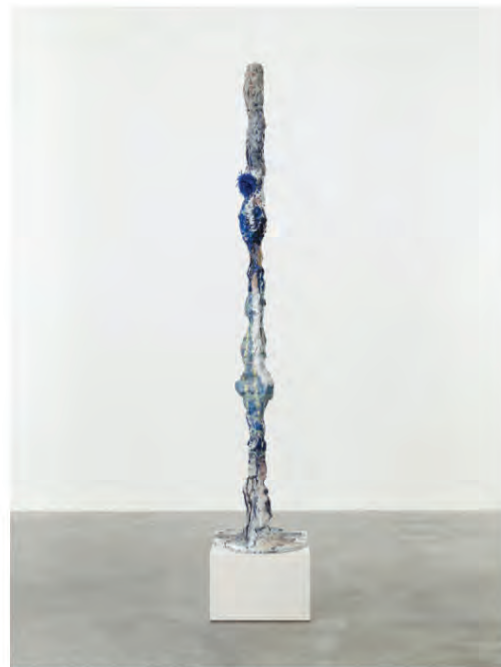
Rebecca Warren, “Ooo,” 2014. Hand-painted bronze on painted MDF pedestal. Sculpture: 93 x 21 5/8 x 19 3/4”; Overall: 115 1/2 x 21 5/8 x 19 3/4”. ©Rebecca Warren, Courtesy Matthew Marks Gallery.

sometimes humorous, at others art historical, as a means of lightening the burden of material solemnity. “Basquiat” (2014), is painted almost completely