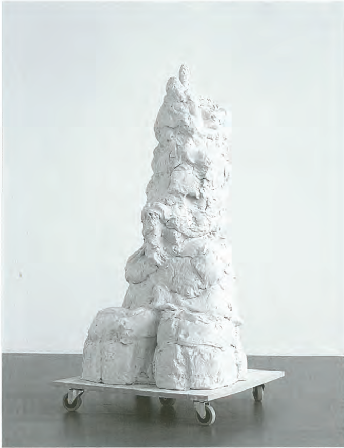
REBECCA WARREN, PRIVATE SCHMIDT , 2004, reinforced clay, MDF, wheels, 72 7 / 8 x 35 7 / 8 x 35 7 / 8 " / SOLDAT SCHMIDT , verstärkter Ton, MDF, Räder, 185 x 91 x 91 cm.

the particular bodily types that are regarded so disfavorably in females these days: wide hips, thick goose-thighs, big bottoms, and general big-bonedness. Elements of many sexual paraphilias can be seen in Crumb's work, such as Saliromania , which is the deriving of erotic pleasure from soiling or spoiling the object of desire. (This may include tearing or damaging their clothing, covering them in mud or filth, or otherwise disheveling them—a fetish that can also involve the defacing of statues or pictures of attractive people, especially celebrities, and the forming of collections of defaced art.) Crumb, as a cartoonist, also summons ideas of Schediaphilia (more humorously known as Toonophilia ), which is love or sexual arousal towards cartoon characters. Crumb's work, unlike Warren's, includes visceral hatreds, often towards conventionally beautiful women and the highly esteemed status they enjoy, and it is possible to consider Warren's appropriation of him as allusive of the need, or not, to "earn" or "deserve" love in this world—for men as well as women—much of it centered around exaggerated ideas of beauty.