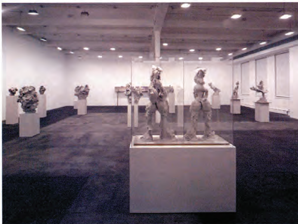
View of Rebecca Warren's exhibition "Pas de Deux," 2005; at Matthew Marks. (Review on p. 183.)

or elbow emerges from a scribbly whirl of lines are three masses of unpainted clay sporting breasts, limbs, lumps and flowers. About