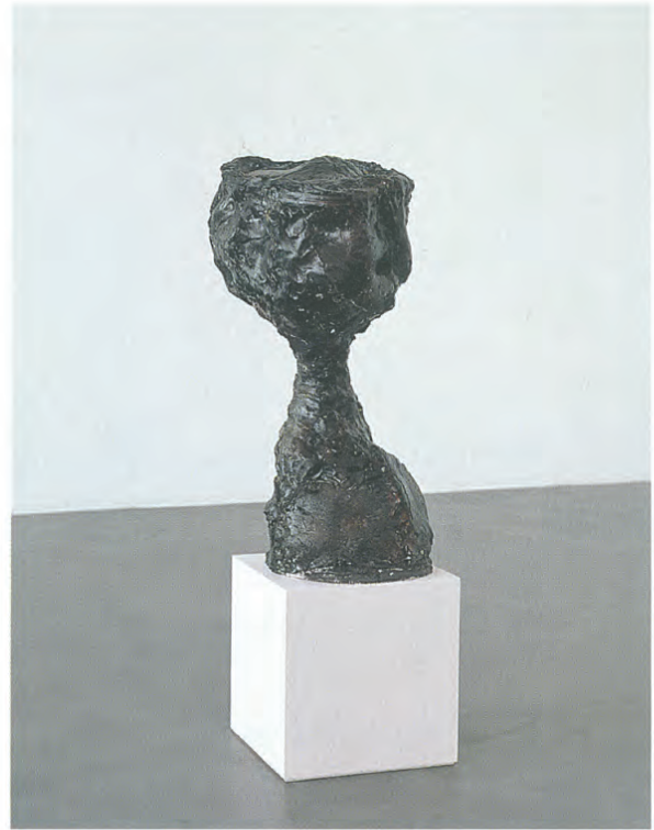
REBECCA WARREN, LIGHT OF THE WORLD , 2004, reinforced clay, acrylic paint, pom pom, 44 \frac{1}{8} x 13 \frac{3}{8} x 13 \frac{3}{8} " / LICHT DER WELT , verstärkter Ton, Acrylfarbe, Pompon, 112 x 34 x 34 cm.

ter, the piece-molds sometimes re-filled with fresh clay, the originals and the variations remaining in Rodin's possession for the rest of his life.