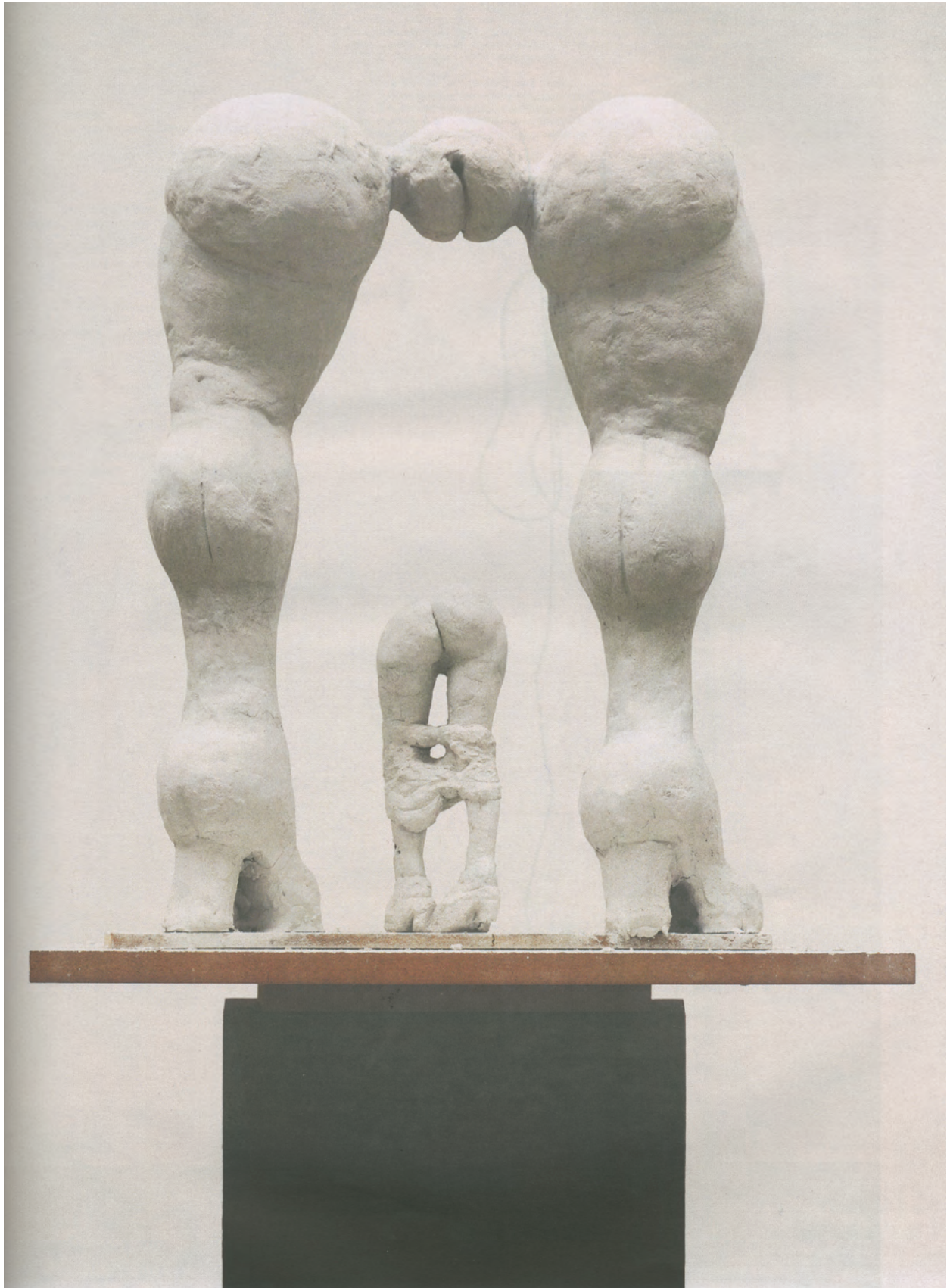
Oehlen, Albert. "Material Object." Mousse , April/May 2016, pp. 140–53.