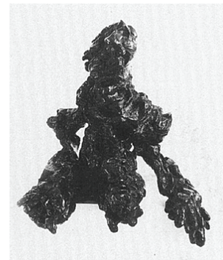
WILLEM DE KOONING, LARGE TORSO, 1974, bronze, 36 x 36 x 26 1/2" / GROSSER TORSO, Bronze, 91,5 x 91,5 x 67,3 cm.