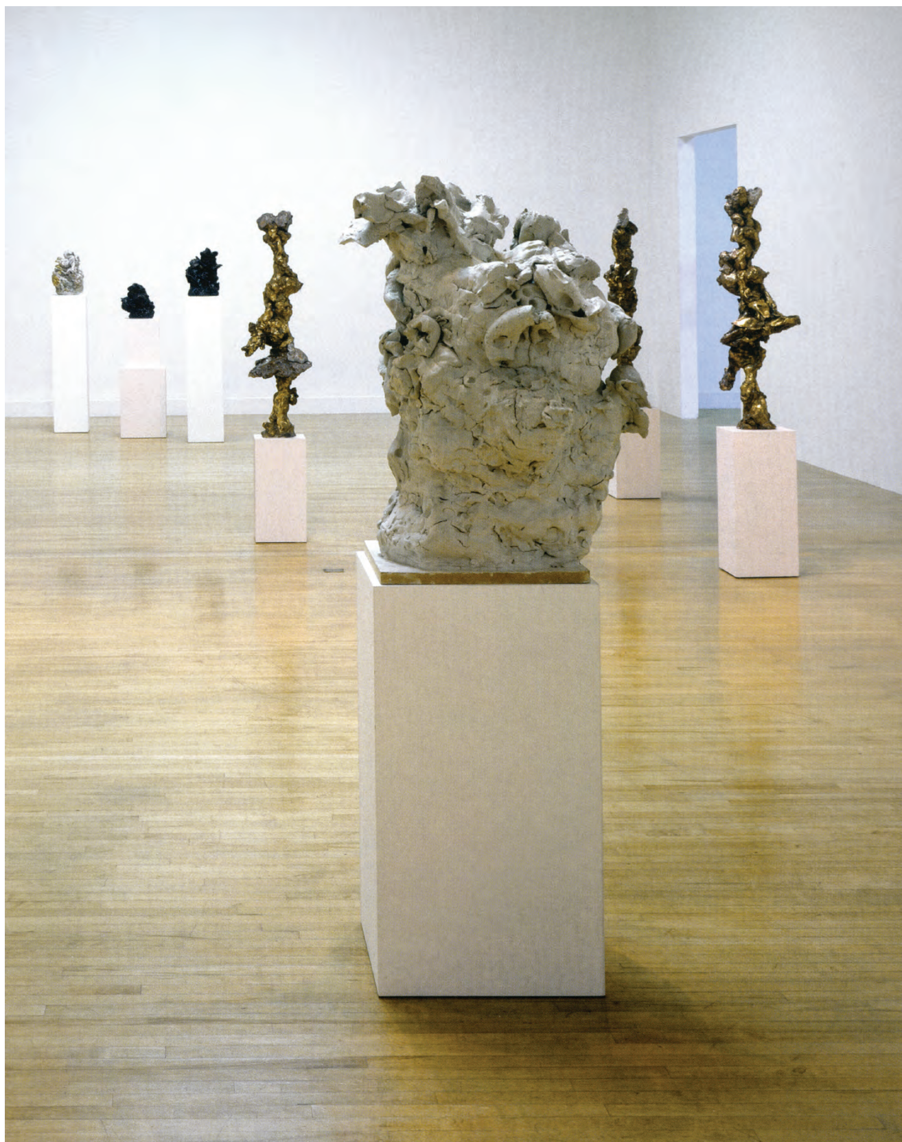
REBECCA WARREN, The Turner Prize , exhibition view, Tate Britain, 2005 / Ausstellungsansicht, Turner-Preis.