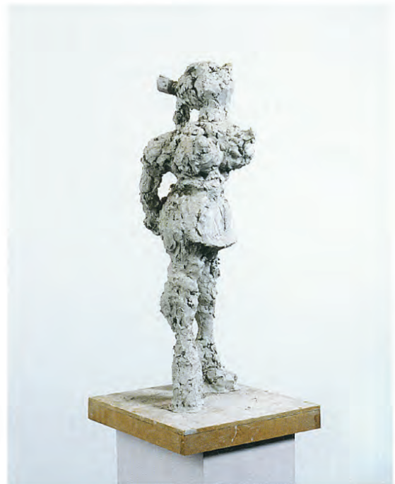
REBECCA WARREN, BUNNY , 2002, reinforced clay, plinth, 28 7 / 8 x 15 x 13 3 / 8 " / Verstärkter Ton, Sockel, 73,5 x 38 x 34,5 cm.

But this is also a model of layering which the work consequently performs in terms of tone: Spend time with BITCH MAGIC ... and a mood of protectiveness and sympathy towards its constituents comes through; you can imagine Warren having somehow saved them from oblivion, irrelevance, lack of use,