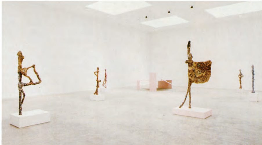
View of "Rebecca Warren," 2017.

In the Hadean period, the earliest geologic era in earth's history, the planet's defining characteristic was its hot, molten surface, which would ultimately cool and harden to create the relatively stable terra firma we enjoy today. Much later, following the arrival of Homo sapiens , the Bronze Age would see the advent of metal tools, after which the sturdier iron supplanted bronze; the alloy would thereafter become the medium of choice for artisans and sculptors. British artist Rebecca Warren recently produced a series of painted bronze sculptures titled "Los Hadeans" (all works 2017), whose spindly forms, like cattails gone to seed, call to mind both amorphous protean globs and the blue-chip bronze figurative works on which they are commonly seen as riffs. Yet Warren has remarked that her titles are intentional red herrings, and her "Hadeans," invariably described as Giacomettiesque, on closer inspection reveal themselves to be rather squirrely and coy, diverging from both Giacometti's pathos and the primordial Sturm und Drang of their namesake period.