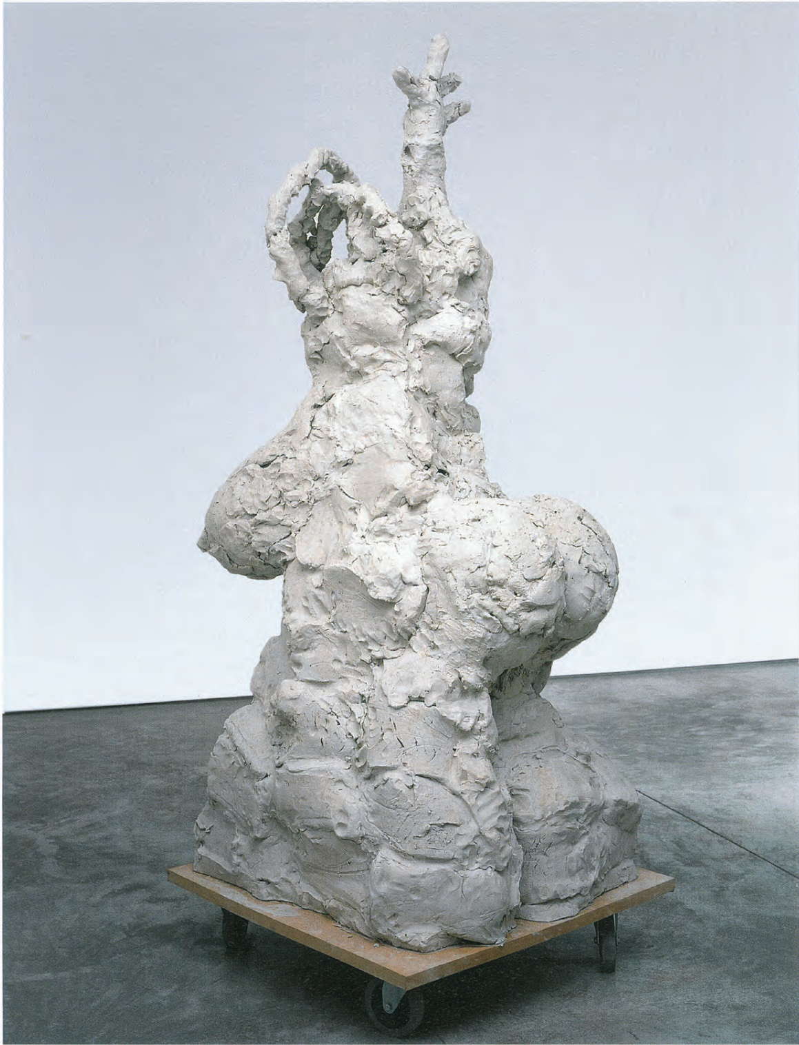
REBECCA WARREN, HOMAGE TO R. CRUMB, MY FATHER , 2003, reinforced clay, MDF, wheels, 83 7/8 x 32 1/8 x 32 1/8" / HOMMAGE AN R. CRUMB, MEINEN VATER , 2003, verstärkter Ton, MDF, Räder, 213 x 81,5 x 81,5 cm.