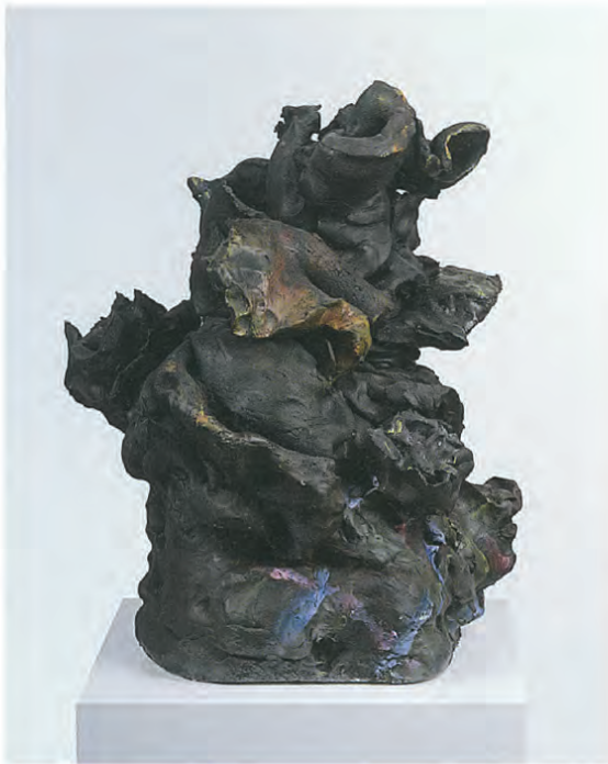
REBECCA WARREN, LOULOU , 2006, painted reinforced clay, plinth, 16 1/2 x 13 3/4 x 13" / bemalter verstärkter Ton, Sockel, 42 x 35 x 33 cm.