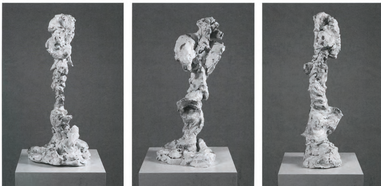
REBECCA WARREN, TOTEMS , 2003, self-hardening clay; height: a) 23 1/2", b) 22", c) 25 1/2" / selbsthärtender Ton; Höhe: a) 60 cm, b) 56 cm, c) 64,8 cm.