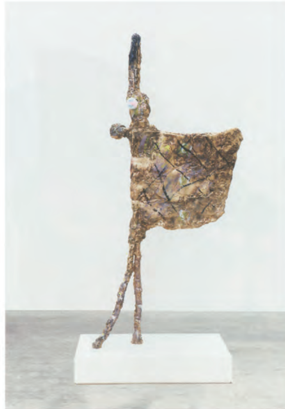
Los Hadeans (III), 2017, hand-painted bronze and pompom on painted MDF pedestal, 226 × 100 × 68 cm.

The exhibition also includes a number of welded-metal sculptures featuring sharp, polished angles, which are at odds with Los Hadeans . These include Early Sculpture , a grey patinated steel pillar that rises to eye-level,