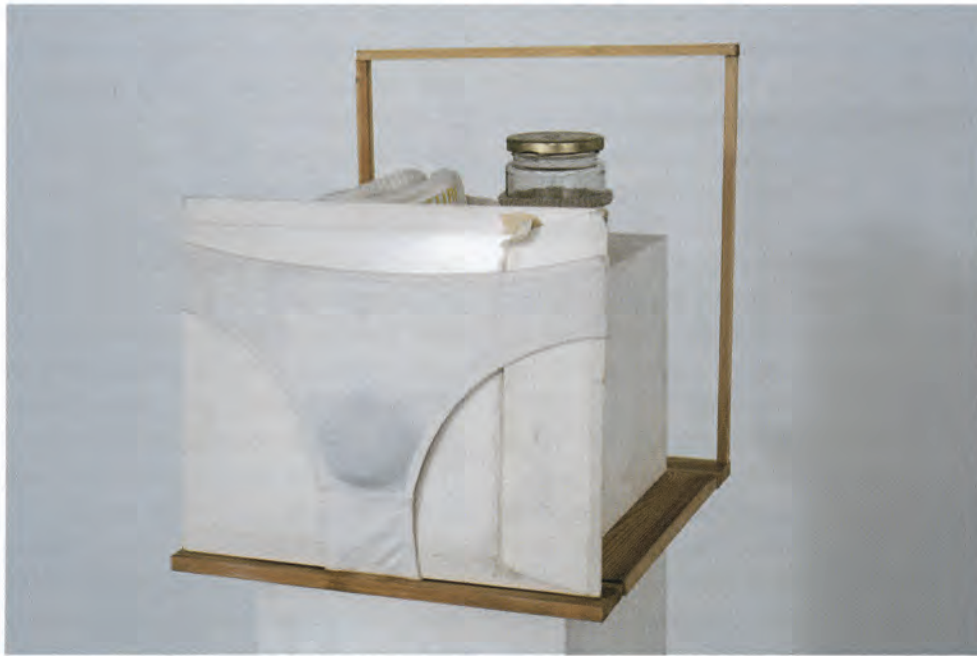
REBECCA WARREN, EVERY ASPECT OF BITCH MAGIC , 1996, mixed media, 52 x 11 7 / 8 x 11 7 / 8 " / LUDERMAGIE IN ALL IHREN ASPEKTEN , 132 x 30 x 30 cm.

Immediately engaging and persuasive as they are, these sculptures challenge us to place them in a contemporary context and to connect with the signs sent out from EVERY ASPECT OF BITCH MAGIC seven years earlier.