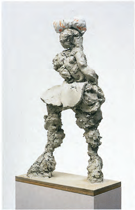
REBECCA WARREN, PONY , 2003, reinforced clay, acrylic paint, plinth, 37 x 10 3 / 8 x 22 1 / 2 " / Verstärkter Ton, Acrylfarbe, Sockel, 94 x 27 x 57 cm.

long time, her work has involved something resembling an inquisitive inhabiting of artistic practices of the past—trying them on for size and often trying several on at once, as if rifling through a dress-up box found in a dusty attic.