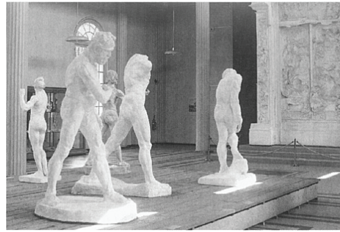
AUGUSTE RODIN, standing figures and THE GATE OF HELL, Musée Rodin, Meudon / Skulpturen und HÖLLENTOR.