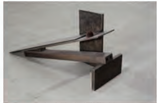
Rebecca Warren, Reclining Figure , 2011, steel and pom-pom, 18 1/2 x 43 1/4 x 13 3/4".

Satire, cleverness, and absurdity are at the core of Rebecca Warren's art. Humorously undercutting platitudes from different sculptural genres, Warren both mocks and participates in the lineage of art-historical standards. In Reclining Figure , 2011, she toys with the monumental sculptures frequently installed in public spaces and outside corporate headquarters. Using steel, she miniaturizes an assembly of geometric forms that, at a colossal scale, would be a bombastic trope of public-art installations. Warren emasculates the sculpture further by including a pom-pom as a kind of ridiculous adornment. In part because of their diminution, the sculptures feel like elaborate mousetraps or fragments from an ineffectual Rube Goldberg machine.