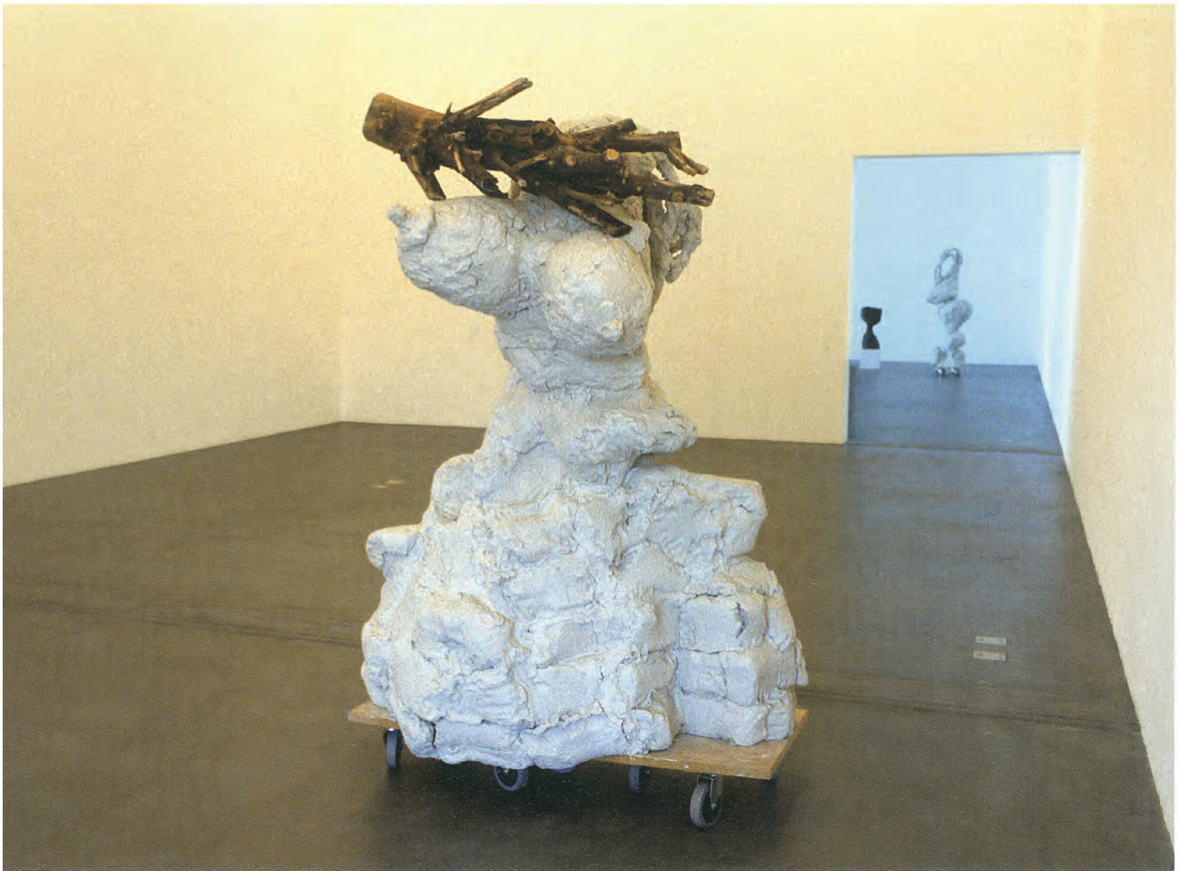
REBECCA WARREN, "Dark Passage", 2004, exhibition view Kunsthalle Zurich, from left to right: LOG LADY, THE LIGHT OF THE WORLD, TEACHER (M.B.), PRIVATE SCHMIDT / Ausstellungsansicht, von links nach rechts: BAUMSTAMM-FRAU, DAS LICHT DER WELT, LEHRER (M.B.), SOLDAT SCHMIDT.

Robert Crumb and the photographer Helmut Newton that bluntly objectifies the female form. Malignly wishful representations of women by male artists have long been in the foreground of her art (as, to an extent, have others by Hollywood cinema: see the 2003 series collectively entitled She , after the 1965 film starring Ursula Andress, and the gold-painted recumbent figure SAPERSTEIN, 2004, named in tribute to the Satanist doctor in Rosemary's Baby ). One extended engagement has been with Edgar