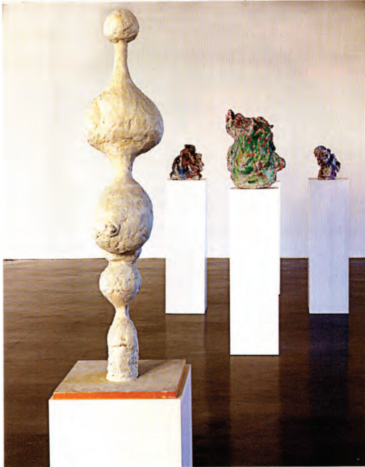
Rebecca Warren 2010 Installation view