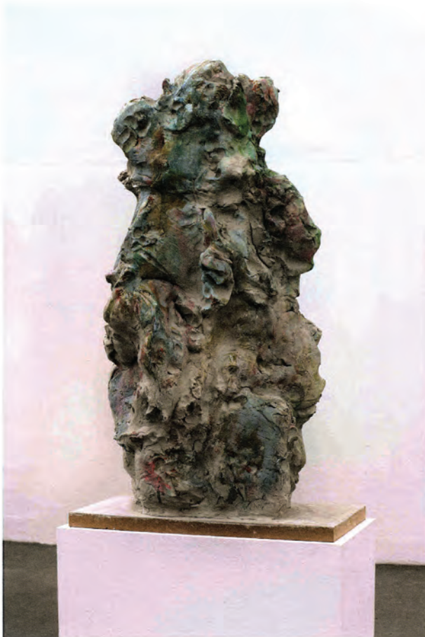
We Are Dead IV , 2008, painted reinforced clay on painted MDF plinth, 79 x 46 x 31 cm exclusive of plinth. © 2009 the artist.