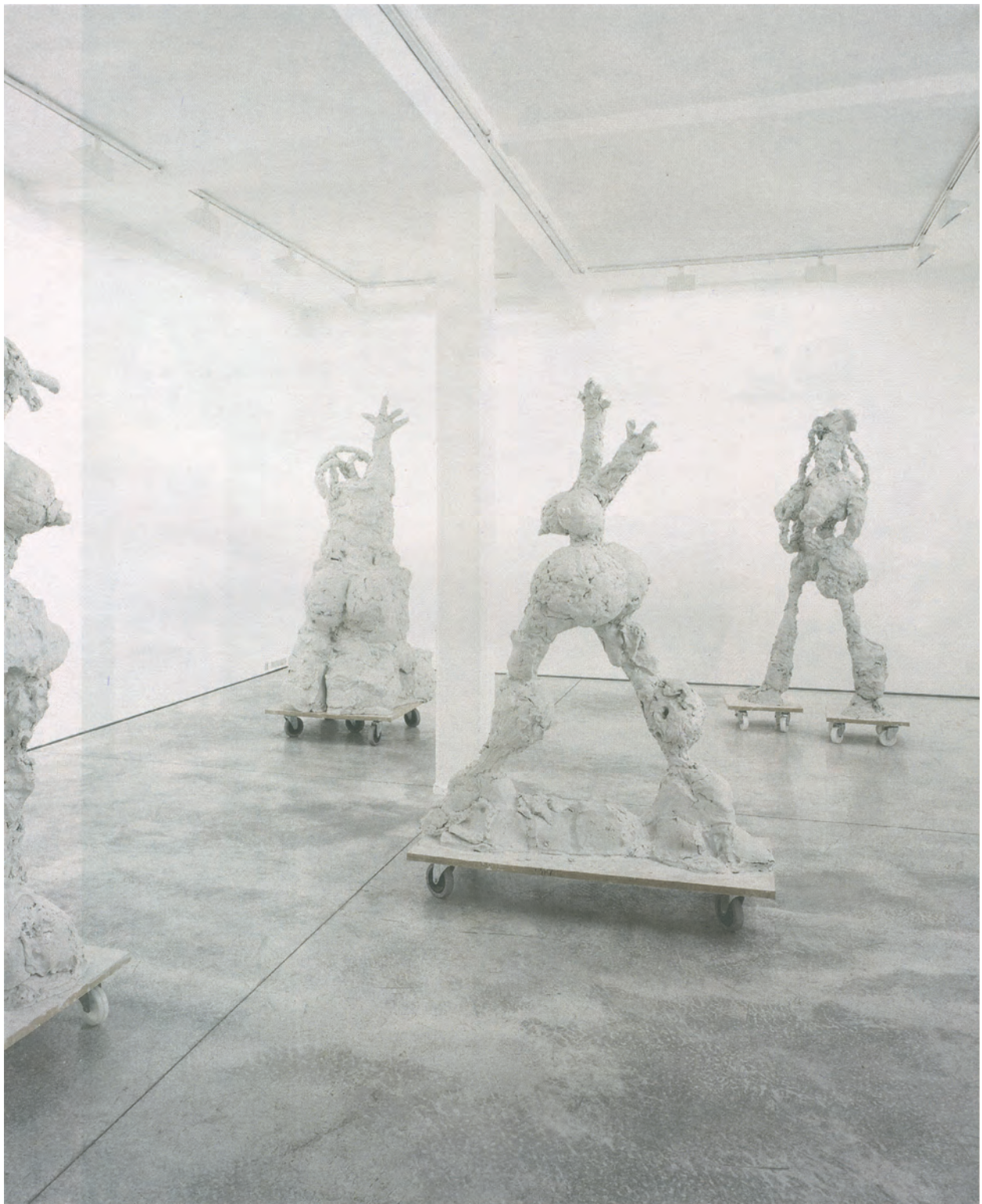
Oehlen, Albert. "Material Object." Mousse , April/May 2016, pp. 140–53.