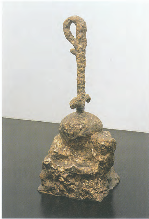
REBECCA WARREN, P.E. , 2005, bronze, 62 \frac{1}{4} x 26 \frac{3}{8} x 24 \frac{3}{4} " / Bronze, 158 x 67 x 63 cm.