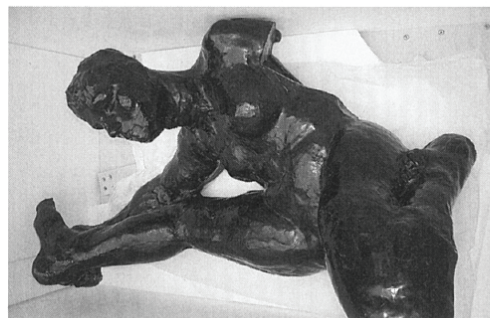
AUGUSTE RODIN, CROUCHING WOMAN, ca. 1895, bronze, 20 3/4 x 13 3/8" / KAUERNDE FRAU, Bronze, 53 x 34 cm.